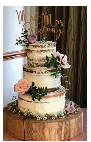
130 Victoria Road West | Cleveleys | FY5 3LG

E: info@onceuponacupcakecleveleys.co.uk | M: 07891 285 987